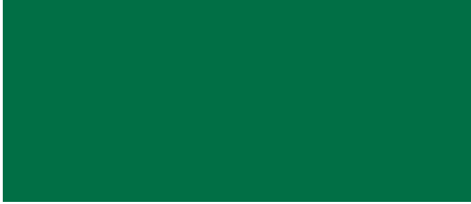
Deep Forest Green Used for graphics or boxes CMYK (100, 50, 100, 0) RGB (0, 111, 69) HEX (#006F45)