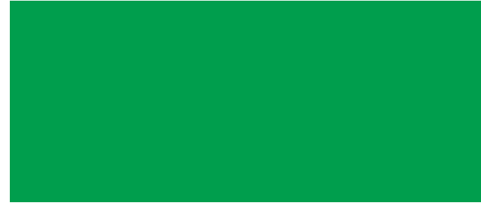
Grassy Green Used for graphics or boxes CMYK (100, 0, 100, 5) RGB (0, 158, 77) HEX (#009E4D)